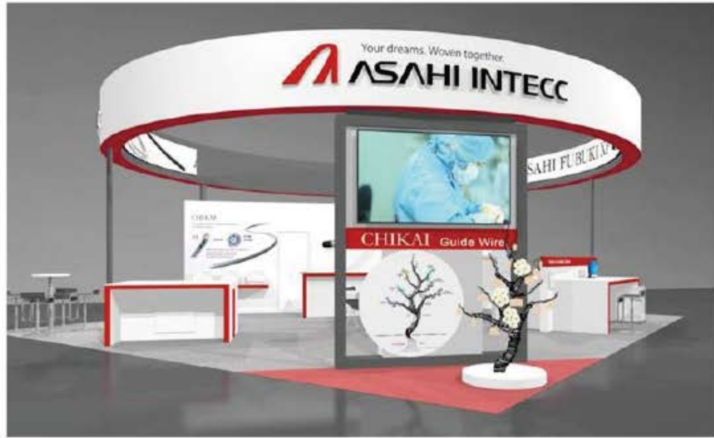
Kyoto International Conference Center 1F

Feel free to visit our booth for the latest product information